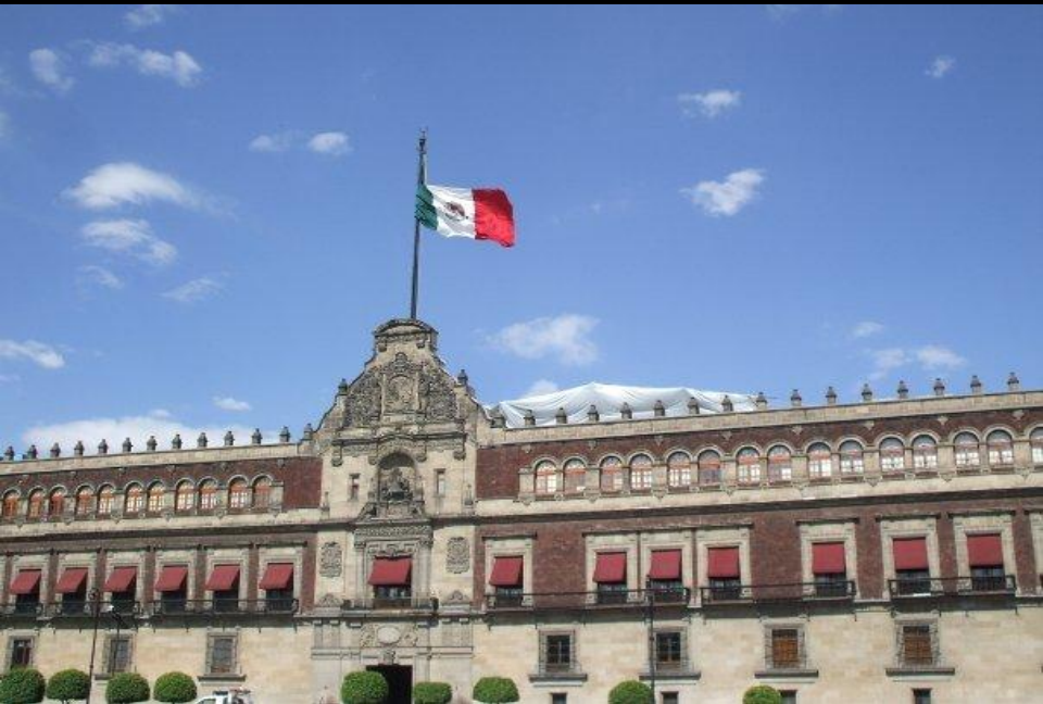
El Palacio Nacional